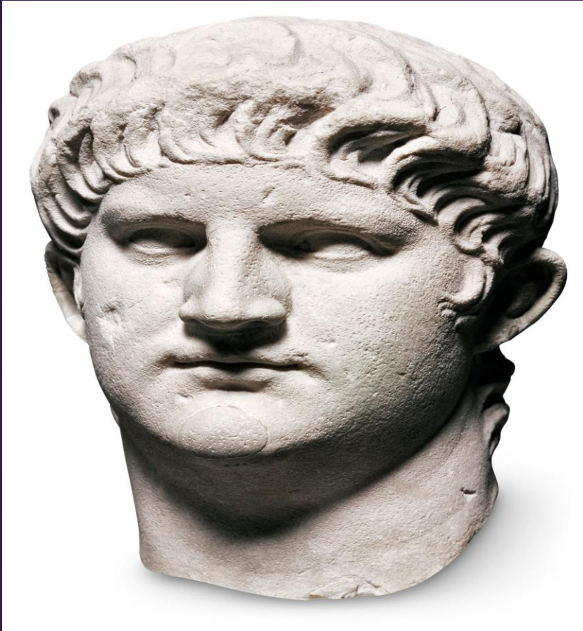
Nero AD 54-68