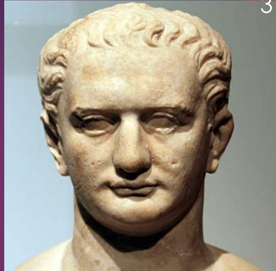
Domitian AD 81-96