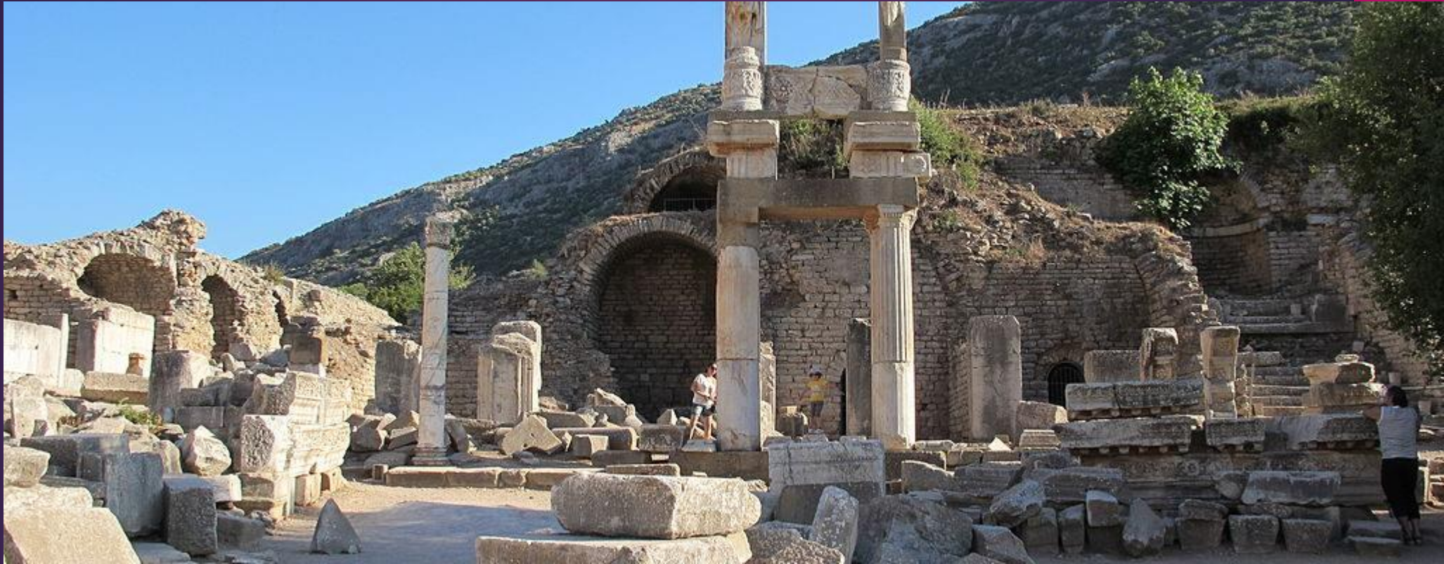
The Square and The Temple of Domitian, Ephesus