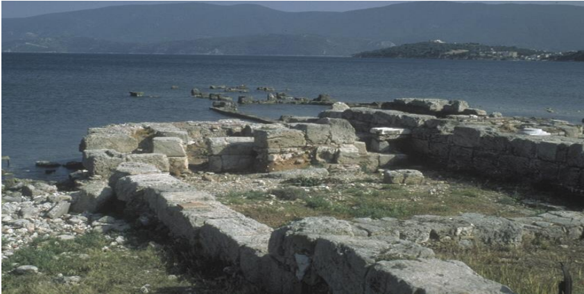
Forum at Corinth