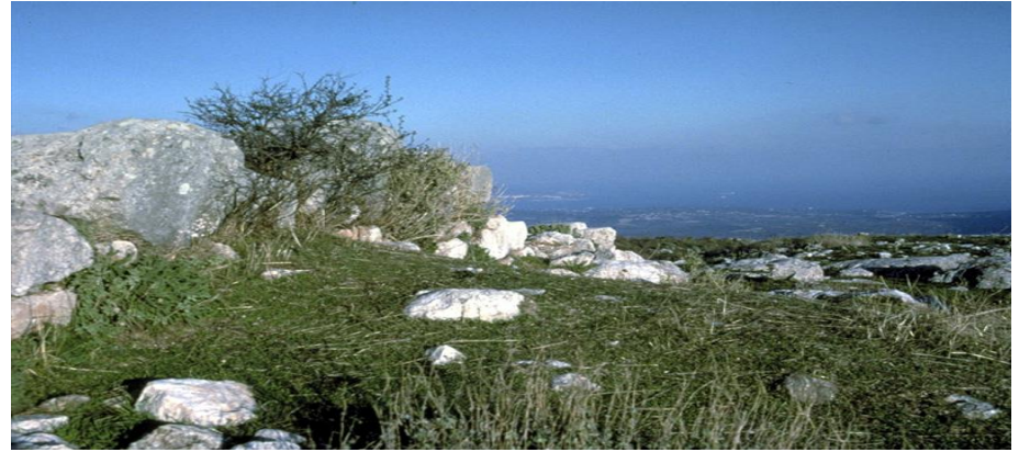
temple of Aphrodite