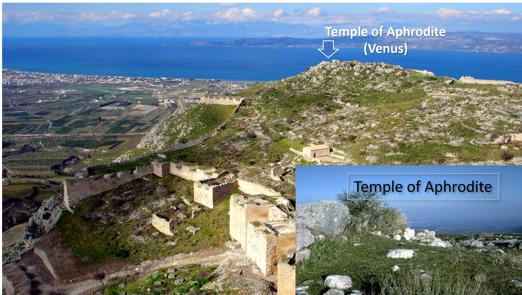
Temple of Aphrodite (Venus)