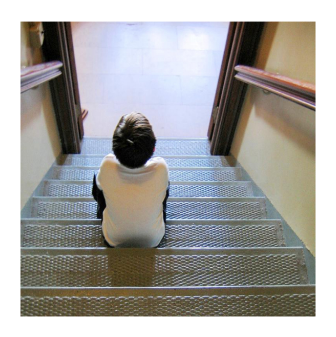
Figure 12.1. Some children may learn at an early age that their gender does not correspond with their sex.